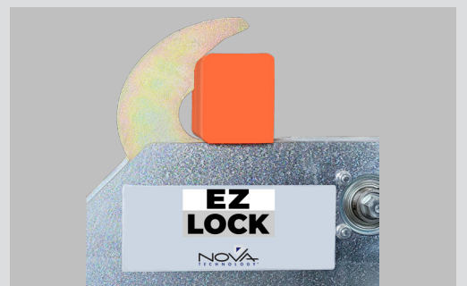
Secures standard trailers and any vehicle with an open RIG bar