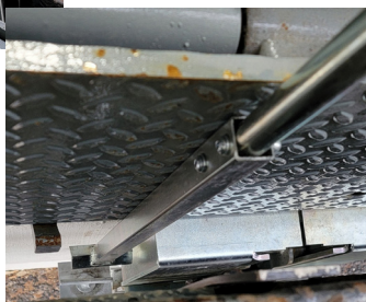
Simple engagement and release operation