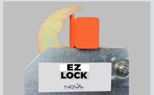
Engages reinforced RIG bars with 4 1/2-inch vertical center plates