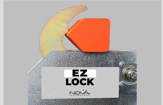
Designed to secure pentagonal RIG bars