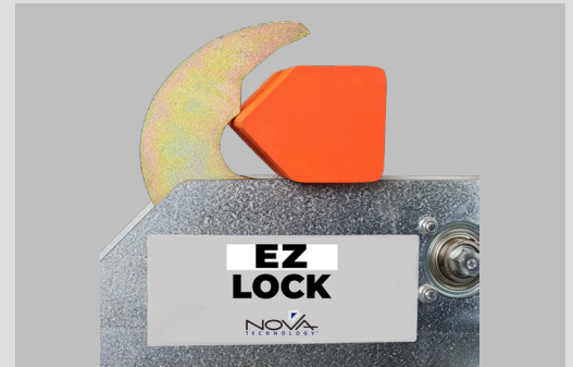
Designed to secure pentagonal RIG bars