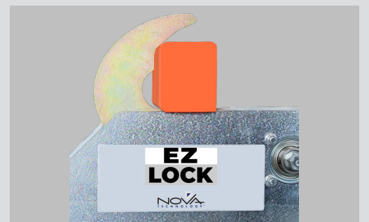
Secures standard trailers and any vehicle with an open RIG bar