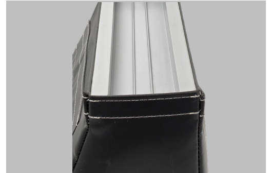
Patented Lightweight Polymer Backer (40% lighter than with standard wood backer—will not warp or rot)