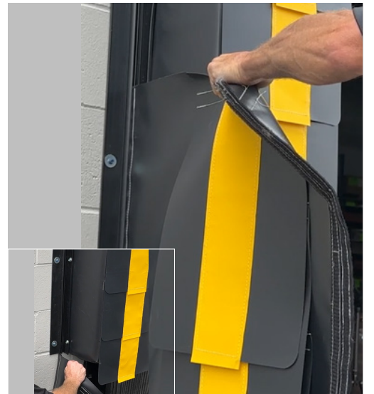
Patented quick-mount system allows easy-to-install replacement covers that slide in, wrap around the seal's face, and attach to Velcro®