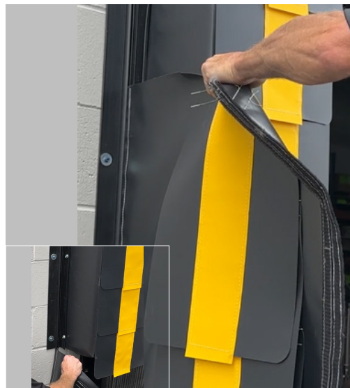
Patented quick-mount system allows easy-to-install replacement covers that slide in, wrap around the seal's face, and attach to Velcro®