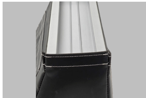
Patented Lightweight Polymer Backer (40% lighter than with standard wood backer—will not warp or rot)