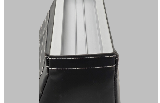
Patented Lightweight Polymer Backer (40% lighter than with standard wood backer—will not warp or rot)