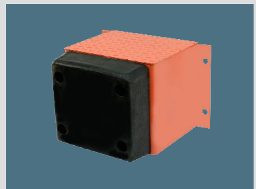
Heavy-duty bumper blocks