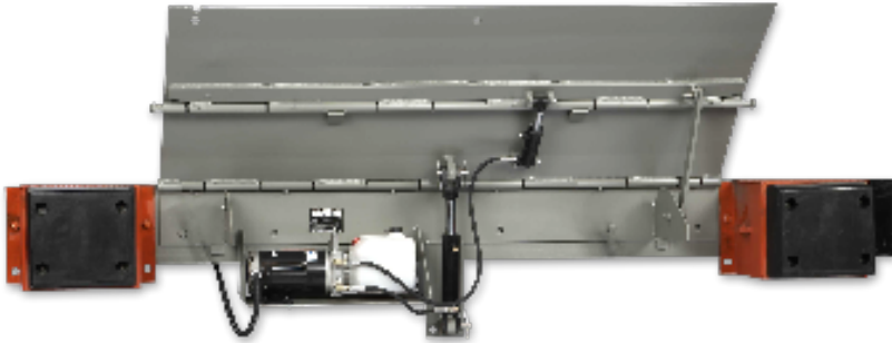
*Hydraulic edge-of-dock leveler shown with heavy duty bumpers