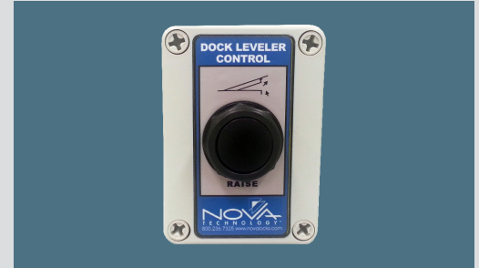
Push-button operation for smooth, consistent operation with a hydraulic system that provides for full float at all positions