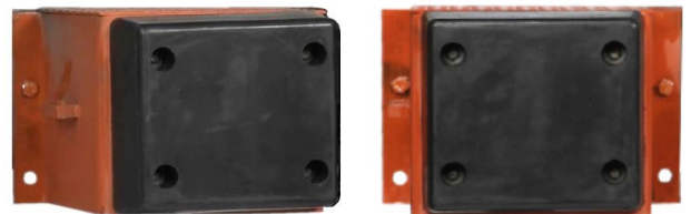
NOVA Molded Rubber Bumpers 4 x 13 x 12-inches

BETTER PROTECTION: NOVA molded rubber bumpers provide more surface area and larger mounting angles to help prevent building damage