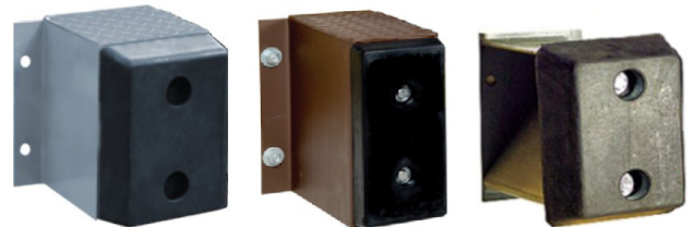
Competitor 1 4 x 10 x 13-inches Competitor 2 2 x 8 x 18-inches Competitor 3 4 x 10 x 13-inches